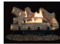
Crescent Hill HD