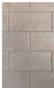
Stacked Refractory Liners