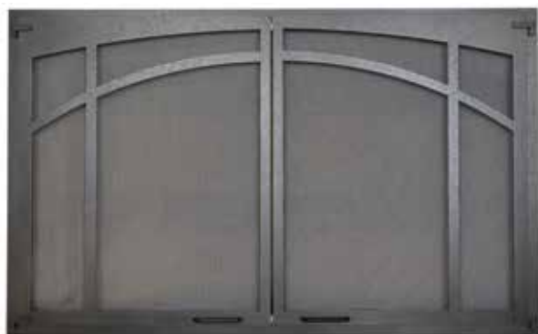
Decorative Twin Pane Screen Door