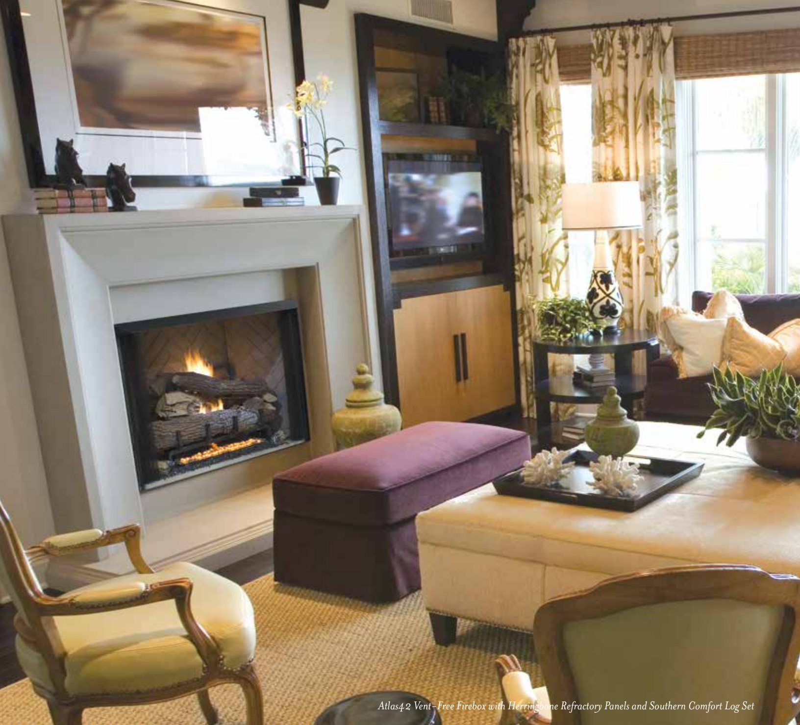
Atlas42 Vent-Free Firebox with Herringbone Refractory Panels and Southern Comfort Log Set

The Atlas's extra tall opening accentuates a variety of standard features to anyone familiar with real masonry fireplaces. The refractory panels are available in traditional stacked and herringbone patterns, with integrated ash lip. These fireboxes do not require heat deflection hoods and readily accept a large variety of vent-free logs.