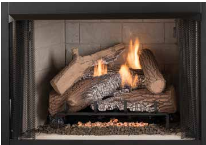
Orion 36" Firebox shown with Refractory Liners & Floor and Rich Oak Vent-Free Logs (sold separately).