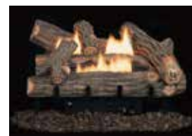
Chestnut Hill HD