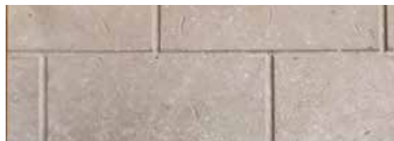
Stacked Refractory Liners & Floor

Compatible with any ANSI Z21.11.2 listed vent-free log set. Choose an Astria vent-free gas log set for best results.