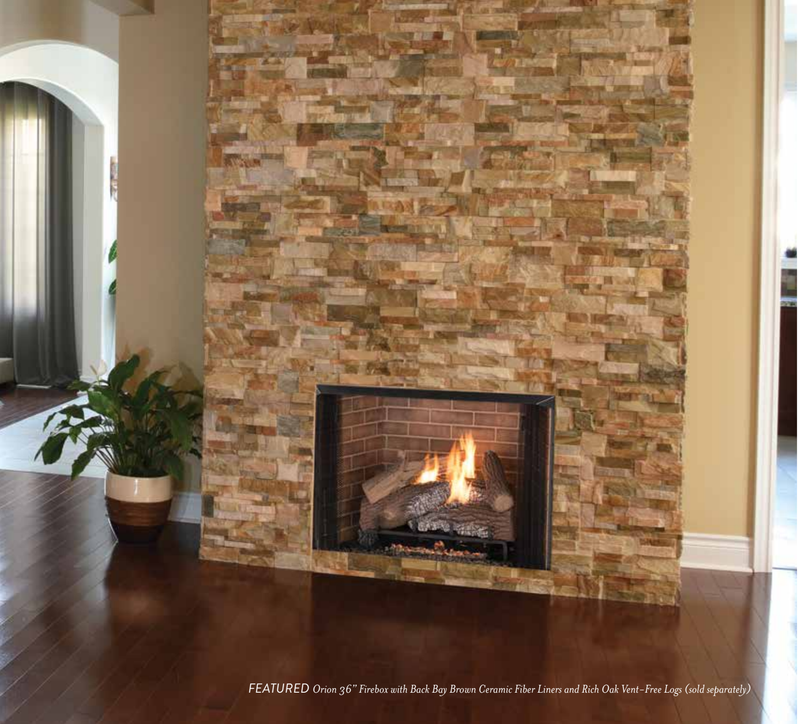
FEATURED Orion 36" Firebox with Back Bay Brown Ceramic Fiber Liners and Rich Oak Vent-Free Logs (sold separately)

The ultimate choice in vent-free firebox design, the Orion offers the style and versatility demanded by today's homeowners. Standard features include multiple interior options and heat-circulating smooth-faced models for increased performance when using a blower. The Orion readily accepts a large variety of vent-free gas logs, and is the smart choice for affordable comfort without compromise.