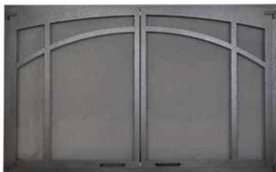
Decorative Twin-Pane Screen Door