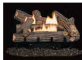
Chestnut Hill HD