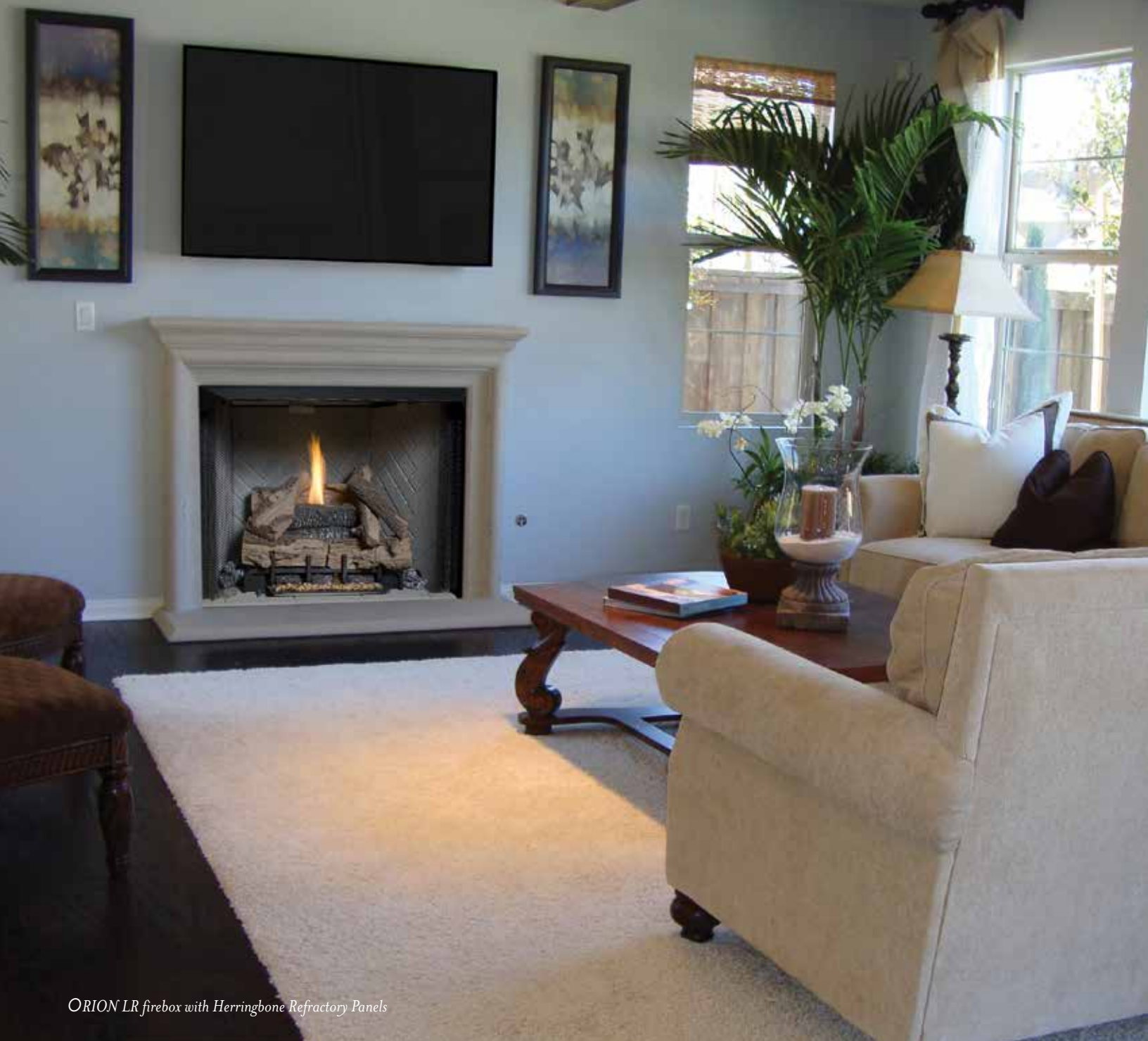
ORION LR firebox with Herringbone Refractory Panels

The tall opening and low to the floor design of the Orion LR series of vent-free fireboxes are welcome features to anyone familiar with traditional site-built masonry fireplaces. The fireplace's refractory brick panels are molded from actual hand-cut firebrick in a traditional stacked or herringbone pattern. Combine with a variety of vent-free gas logs for a beautiful full size fireplace with a traditional masonry appearance.