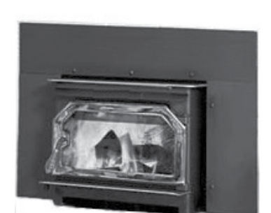
Striker™ C160TGL with Traditional Door