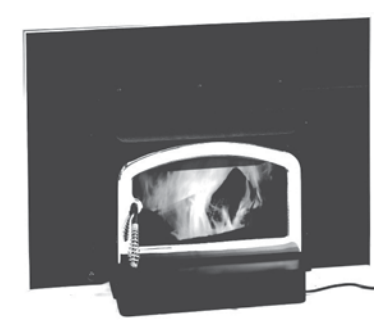
Striker™ C160AGL with Arch Door

Striker ^{\text{TM}} Models C160TGL and C160AGL inserts are safety listed with the following agency: