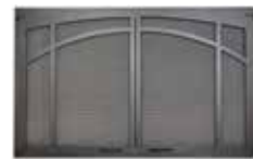
Decorative Twin-Pane Screen Door