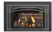
Full View – Iron Rail