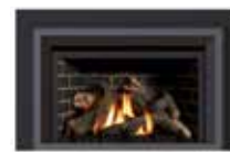
Vista – Vista Trim