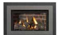
Full View – Highliner