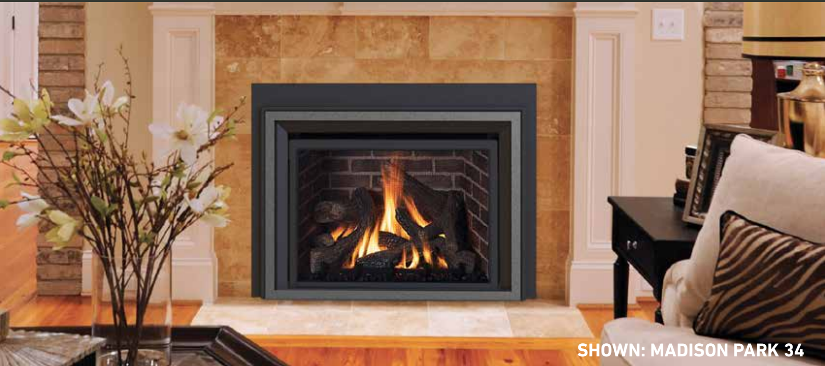
SHOWN: MADISON PARK 34