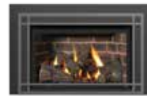
Full View – Frontier