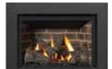
Full View Façade