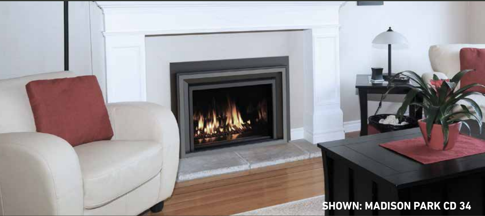
SHOWN: MADISON PARK CD 34