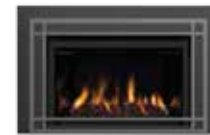
Full View - Frontier