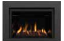
Full View Façade