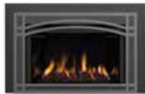
Full View - Iron Rail