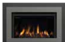
Full View - Highliner