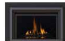
Vista - Vista Trim