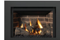
Full Face Façade