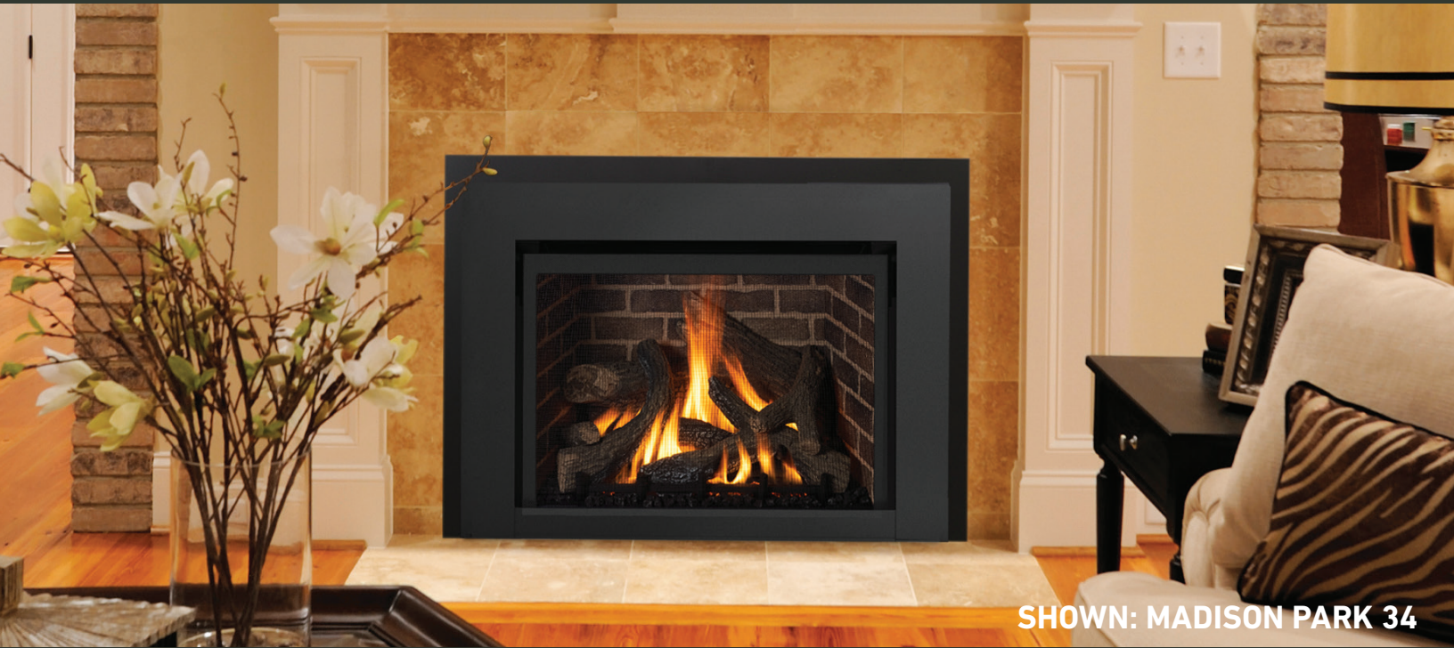
SHOWN: MADISON PARK 34