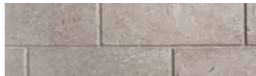
Stacked Refractory Liners & Floor