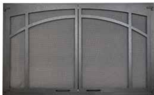
Decorative Twin-Pane Screen Door