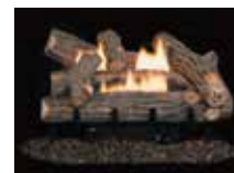
Chestnut Hill HD