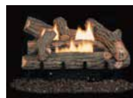
Crescent Hill HD