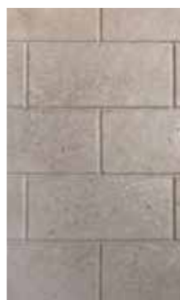
Stacked Refractory Liners