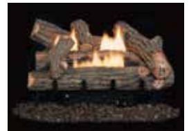
Crescent Hill HD