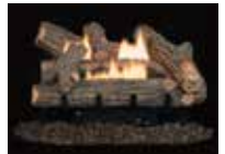
Crescent Hill HD