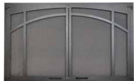
Decorative Twin Pane Screen