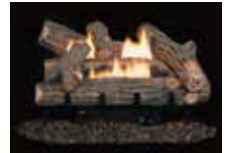
Crescent Hill HD