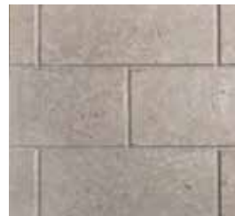
Stacked Refractory Liner