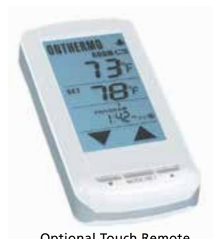
Optional Touch Remote