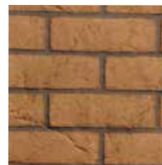
Buff Stacked Ceramic Fiber Liner